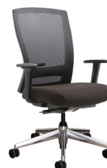
Featured with arms

The Buro Mentor offers the latest in contemporary and ergonomic design. The Mentor is a stand out candidate for any board room, office or home office environment. Featuring a complete range of ergonomic features, easy to use synchronised seating adjustments and outstanding comfort.