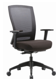
Featured with arms

The Buro Mentor offers the latest in contemporary and ergonomic design. The Mentor is a stand out candidate for any board room, office or home office environment. Featuring a complete range of ergonomic features, easy to use synchronised seating adjustments and outstanding comfort.