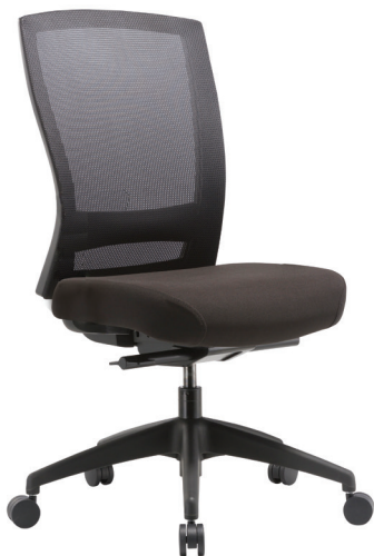
Buro Mentor chair with nylon base