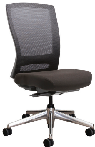
Buro Mentor chair with polished base