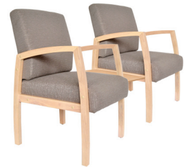
Bella featured with centre linking table (indent only)