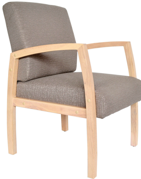
Gin Rummy - Gravel Anti-Microbial Upholstery